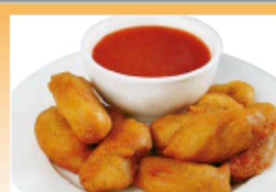
Sweet &amp; Sour Chicken Balls