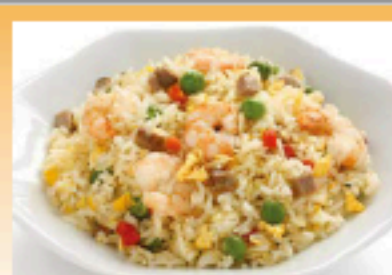
Special Fried Rice