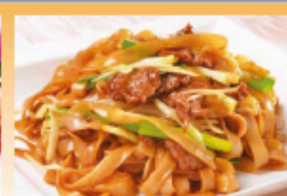
Beef Ho Fun with Beansprouts