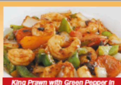
King Prawn with Green Pepper in Black Bean Sauce