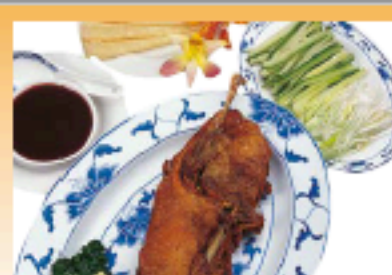
Crispy Aromatic Duck