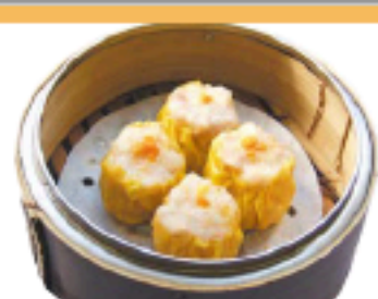
Siu Mai (Pork Dumpling)