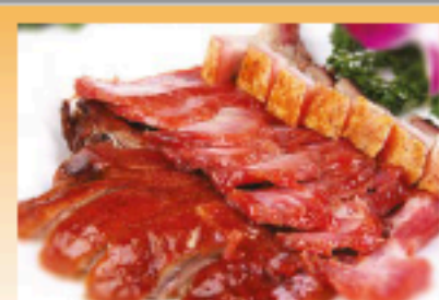
Roast BBQ Meat